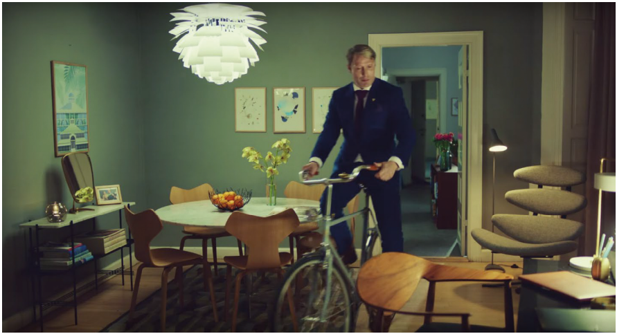
Figure 4. Still from Carlsberg beer advertisement, Fold7 agency 2019

are icons emphasising cultural belonging, and their accumulation in a short advertisement functions to overwhelm the potential consumer with stimuli, which function in the recipient's consciousness as conditions necessary to achieve the desired state of Danish bliss. This kind of message, accentuating the overall well-being that can be achieved through acquiring various goods, is indeed a very universal message. For this reason, the campaign has been broadcast both internationally and locally; it underlines the factors contributing to create the Scandinavian lifestyle, including design (Nielsen 2021: 295–313).