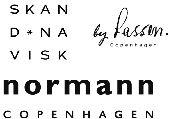
Figure 2. Logotypes of Scandinavian design brands – Normann Copenhagen, By Lassen Copenhagen, Skandinavisk