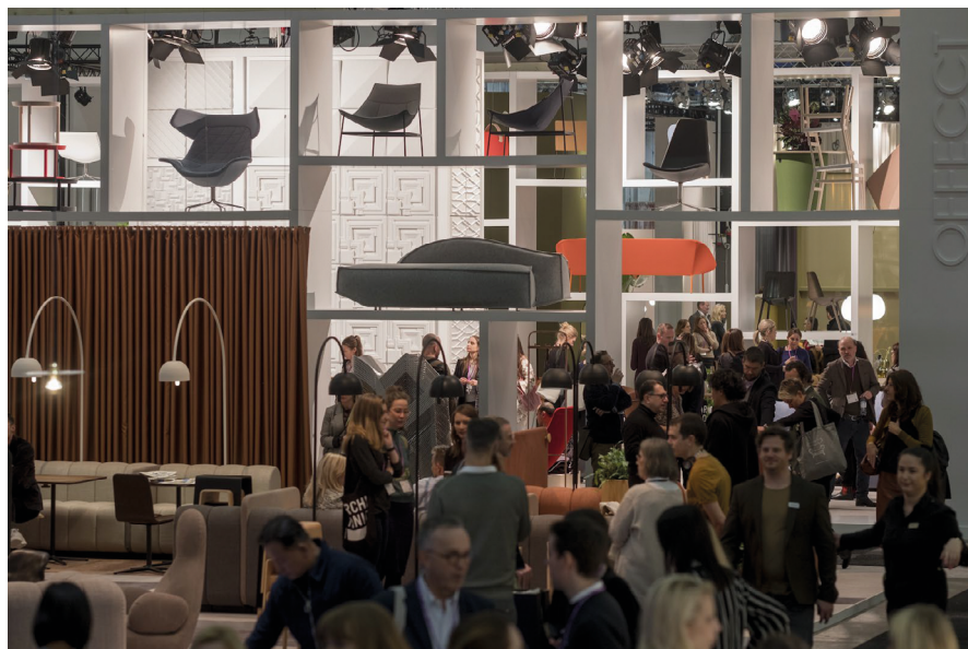
Figure 3. Stockholm Furniture and Light Fair 2019, Source: https://ifdm.design/2020/01/22/la-stockholm-furniture-light-fair-a-quota-70/, accessed 25.07.2023.

Social media plays a very important role in the promotion of Scandinavian design. The enduring popularity of design from the North can be attributed to several factors. First, most of the companies' social media accounts are run with great care and commitment. Their content includes not only current products but often aims to educate the audience by popularising questions regarding design history, production methods, and applied craftsmanship. This type of narration accentuates the long tradition of the brand and its commitment to preserving the shared values of Scandinavian design. On the contemporary level, the leading firms are careful to update their visual content constantly; they interact with their audience, tag customers, and try to maintain relationships with their peers. Moreover, to broaden their scope and impact they are very keen to share photos of customers who have uploaded private content containing branded products.